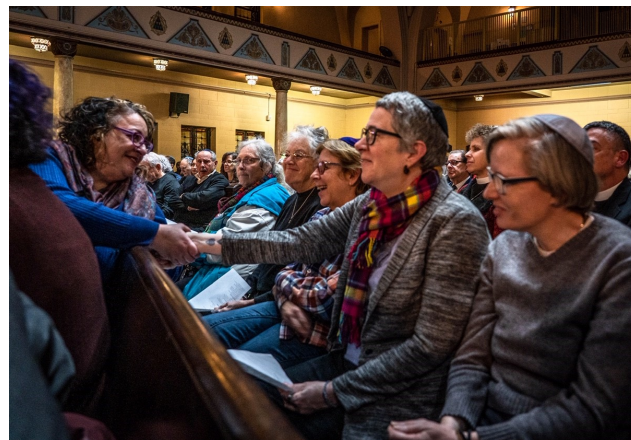
At the healing vigil, making friends

But you, Source of strength / מקור כח Makor koach —you programmed us with hope. With yearning. With the will to strive, to connect and to defy barriers to our life force. We feel the love and good will around us but we don't know what to do with the shadows we know are lurking, now—in every corner—with words of hate and guns drawn.