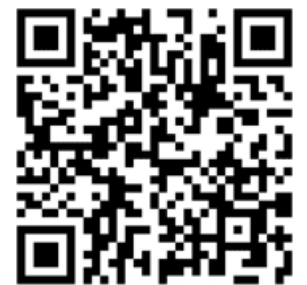
Scan with QR Studio

Help provide food and basic necessities for our neighbors in need. Adding a few items to your regular shopping trips can make a world of difference. If you prefer to shop online, you can make your purchases using our Amazon wishlist . We’ve even created a QR code that takes you right