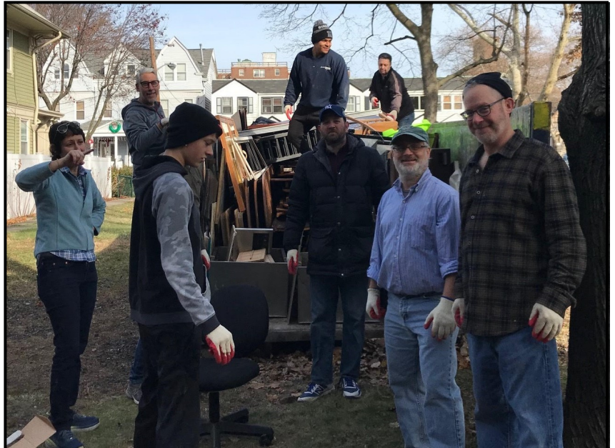
Dozens of congregants came to Dumpster Day to help us clean up the Temple. It looks great!

Would you like to sponsor an oneg Shabbat? This joyful gathering is a great way to recognize an accomplishment, celebrate a birthday, let the world know you are happy, or honor the memory of a loved one on a yarzeit. Choose your date! Click here.