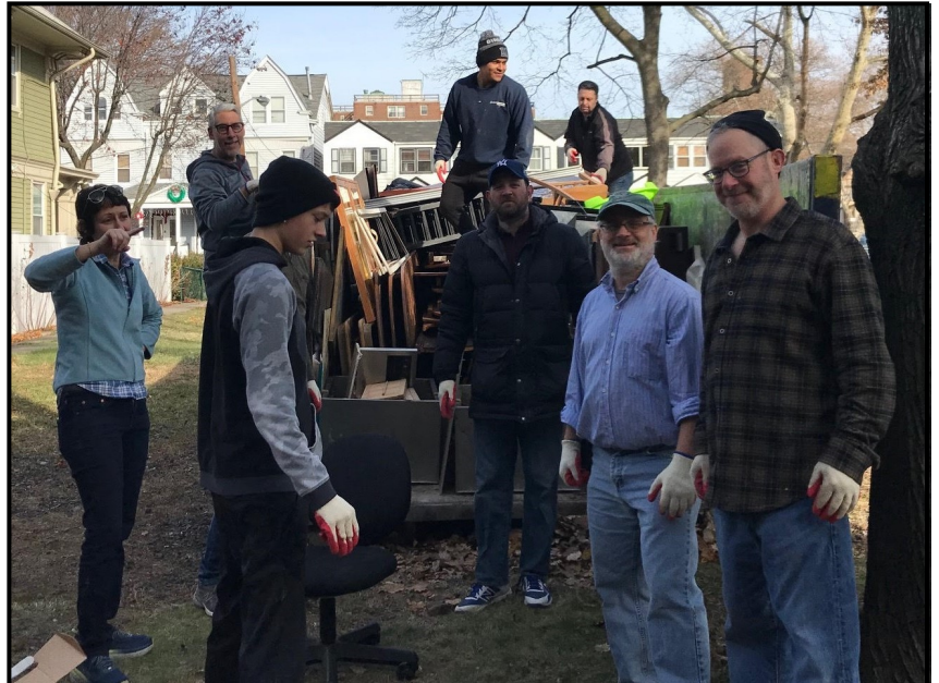
Dozens of congregants came to Dumpster Day to help us clean up the Temple. It looks great!

Would you like to sponsor an oneg Shabbat? This joyful gathering is a great way to recognize an accomplishment, celebrate a birthday, let the world know you are happy, or honor the memory of a loved one on a yarzeit. Choose your date! Click here.