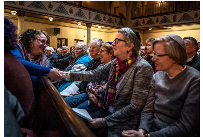
At the healing vigil, making friends

But you, Source of strength / מקור כח Makor koach —you programmed us with hope. With yearning. With the will to strive, to connect and to defy barriers to our life force. We feel the love and good will around us but we don't know what to do with the shadows we know are lurking, now—in every corner—with words of hate and guns drawn.