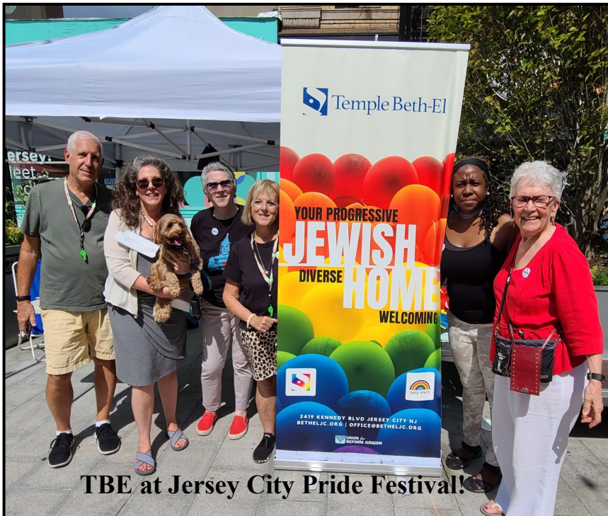
TBE at Jersey City Pride Festival!

We had a great time at JC Pride on August 27.